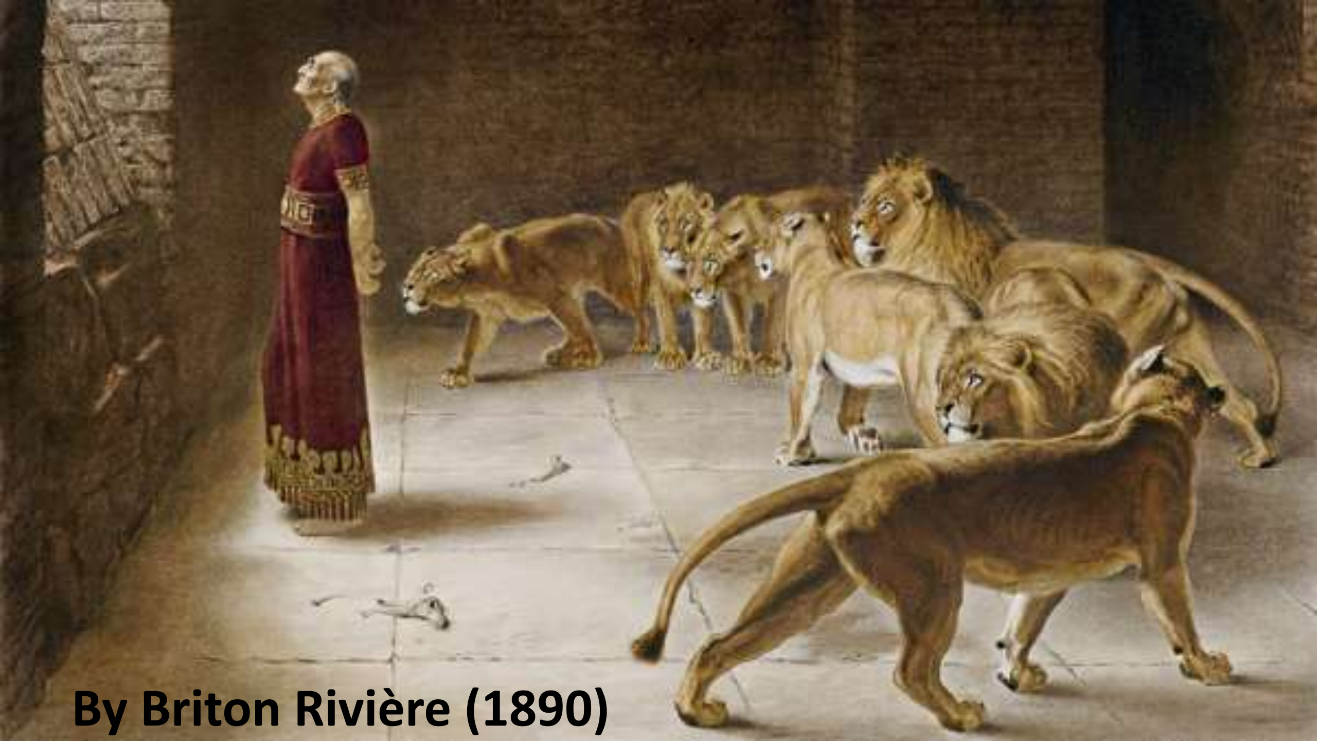
By Briton Rivière (1890)