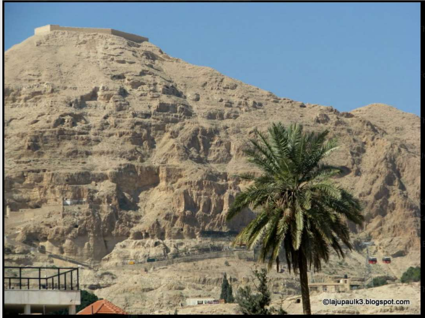
Mount of Temptation today