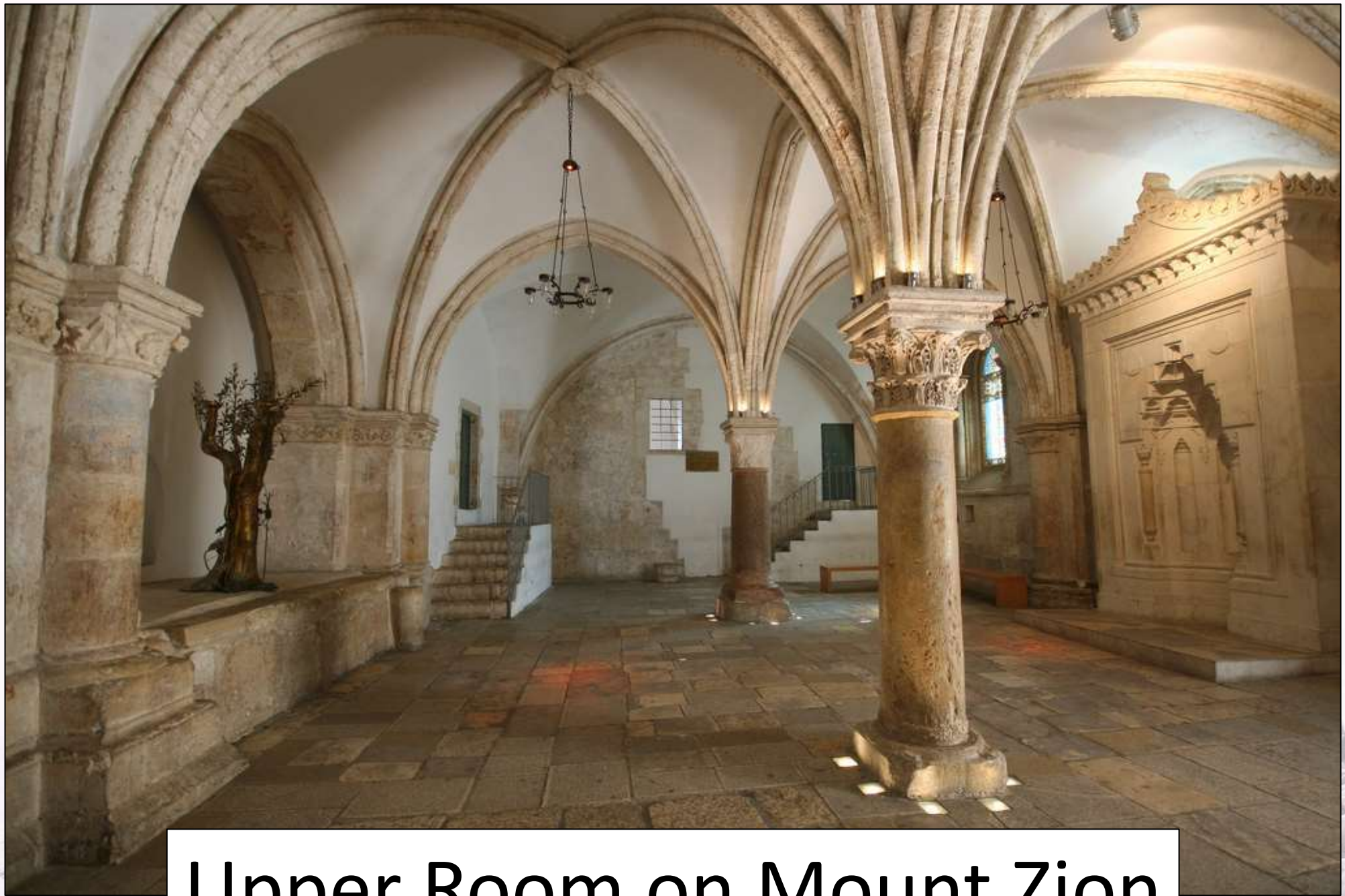
Upper Room on Mount Zion