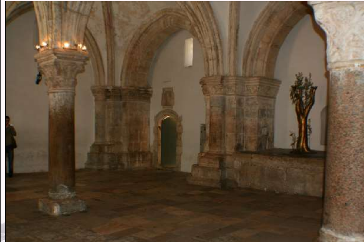
Upper Room today